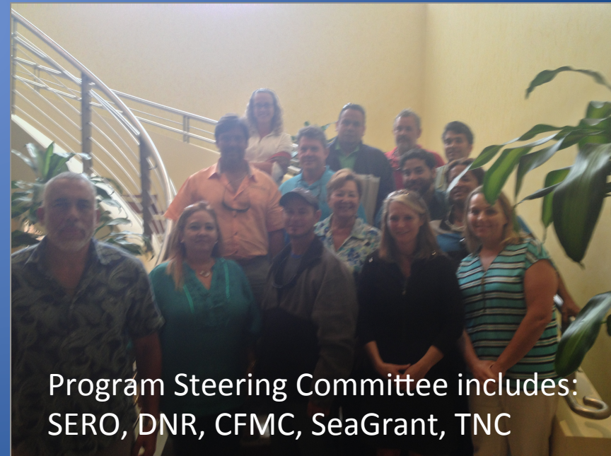
Program Steering Committee includes: SERO, DNR, CFMC, SeaGrant, TNC